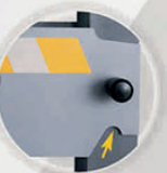
Special Design for More Height Position of Working Bench