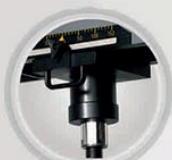
Scale & Sliding Cylinder with Handle