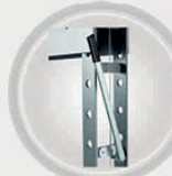
Handle Assy Holder