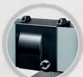
Winch Protection Cover