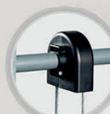
Pulley Protection Cover