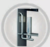
Winch Handle Holder