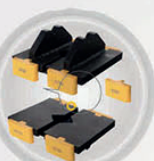
V-Block & 180° Guiding Design